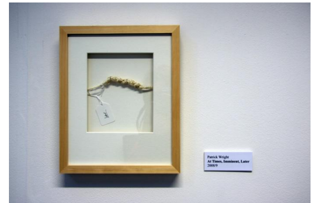
'Later' from 'At Times, Imminent, Later' 2008/9

Early Music Festival August 2005 Leicester Images used in promotional brochures